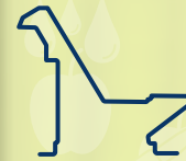
WALC40/WAR65 SA series